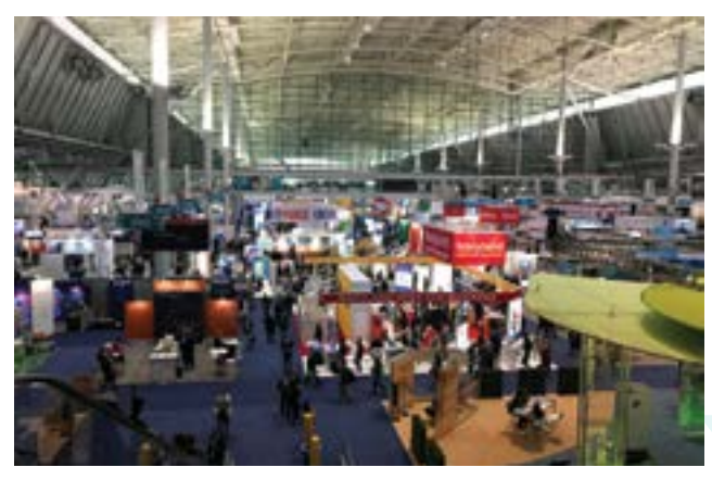
Exhibition hall at the BIO Convention

Pharmaceutical multinationals use these events as an opportunity to meet with new innovators, and catch-up with those they have been paying attention to. These events are one of the most important opportunities for face time with key decision makers within large organisations.