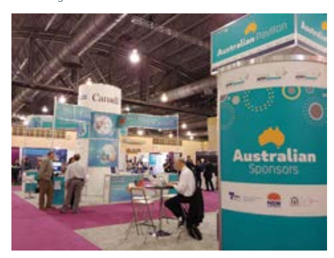
Exhibition hall at The MedTech Conference

The MedTech Conference has a small exhibition area (usually open for two out of the three conference days). Exhibitors range from small medical technologies companies (that are usually past regulatory approval), consultants (regulatory, government relations, market development and manufacturing), as well as large medical technologies multinationals.